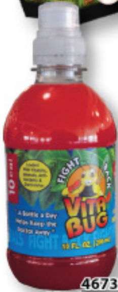
46733 Vita Bug Berry Lt • SRP: $1.69 • 10oz