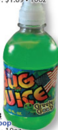
46153 Green Goo • SRP: $1.79 • 10oz