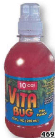
46971 Vita Bug Punch • SRP: $1.69 • 10oz