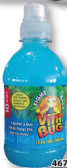
46737 Vita Bug Blue Lt • SRP: $1.69 • 10oz