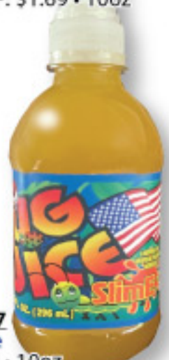
46157 Slime • SRP: $1.79 • 10oz