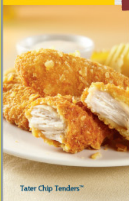
Tater Chip Tenders™

Whether par-fried or fully cooked, our whole muscle chicken tenders are available in coatings that range from satisfyingly crunchy to delicately crispy—all with juicy, savory chicken!