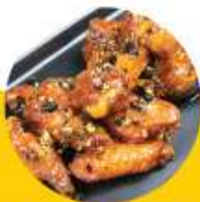
Flamin' Hot Honey Crunch Wings

Holiday Code: 48162 Brakebush Code: 7201