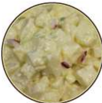
49400 Red Potato Salad Old Fashioned American 5#