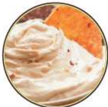
48814 Dip Taco 4.5#