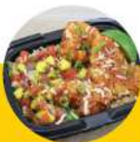
Hawaiian Chicken Bowl

Holiday Code: 47742 Brakebush Code: 5471