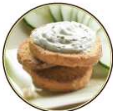
49392 Dip Dill 5#