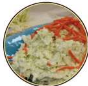
49406 Blue Ribbon Coleslaw 5#