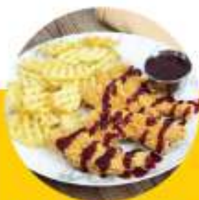
Habanero Serrano Blueberry Sauce

The combination of sweet and spicy or "Swicy" has captured consumer attention in a big way. It's so popular, in fact, that we have two separate Trend Bites exploring this trend and how these flavors continue to take over menus. Get inspired by these "Swicy" applications and be sure to visit brakebush.com/trends for even more ideas!