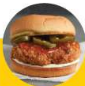
Popper Chicken Sandwich

Holiday Code: 47710 Brakebush Code: 4600