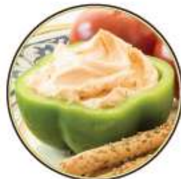
49389 Cheese and Vegetable Spread Dip 5#