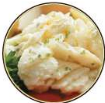
49407 Sliced Potato Salad Gramma 5#