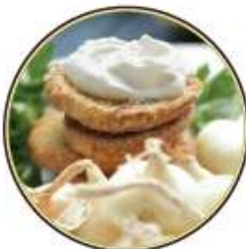
49469 Dip French Onion 5#