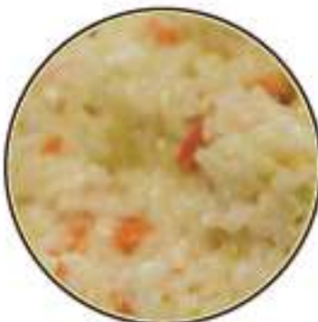
49399 Coleslaw Dixie Style 5#