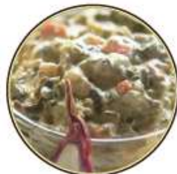
49391 Dip Spinach w/Water Chestnuts 5#