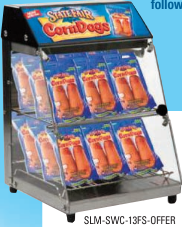
SLM-SWC-13FS-OFFER 12" X 12" X 18"